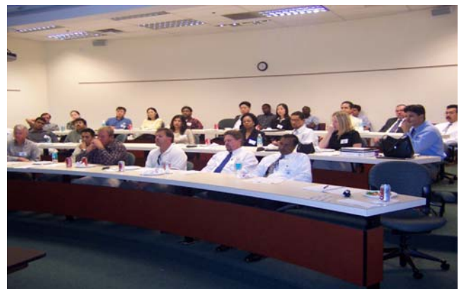
Part of the group that participated in the TBITE Second Meeting at University of South Florida.