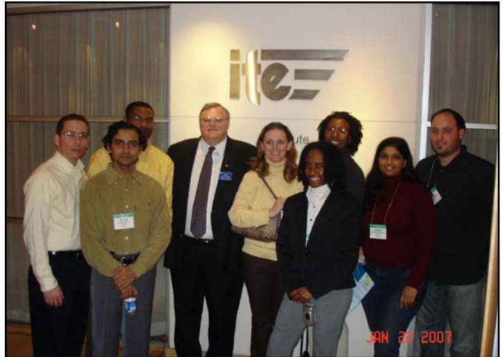
USF Students with president of ITE at the Student Member Reception in Washington D.C.

The USF ITE Student Chapter is also continuing to team up with the USF College of Engineering and the Center for Urban Transportation Research to host the graduate transportation seminar series offered at USF. In this seminar transportation professionals, professors, students, and companies, have the opportunity to present their work on transportation research, projects and everything that has to do with transportation.